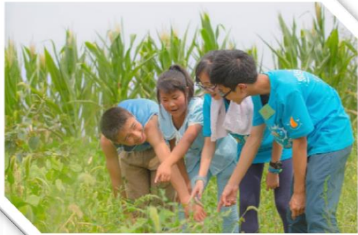
Home visit, live with Mainland student's family, experience rural daily life, agriculture, picking vegetables