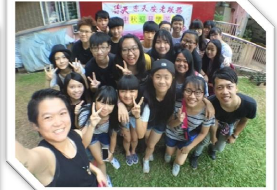
Visit the elderly home