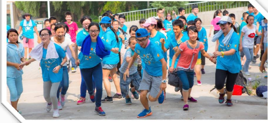
Youth to experience the mountainous life and nurture both HK and Mainland students with contribution and leadership