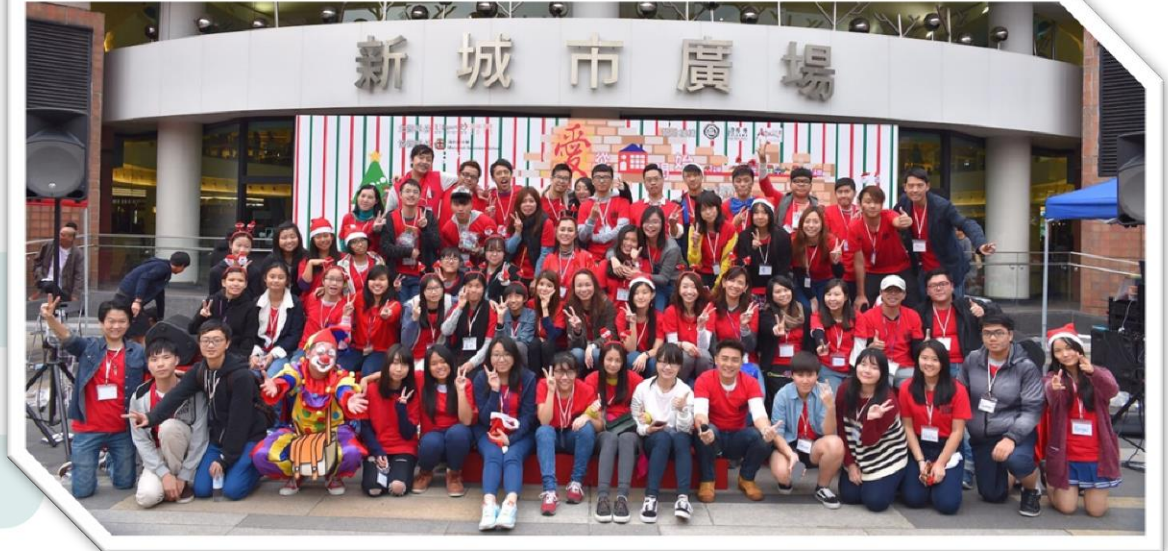
"Start Love from Family" Carnival