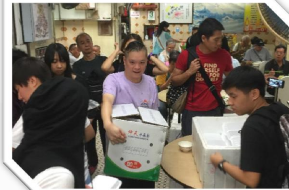
Send rice to street sleepers