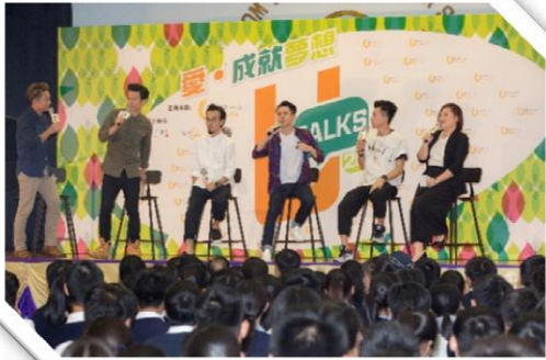
C AllStar as guest speaker at CCC Yenching College