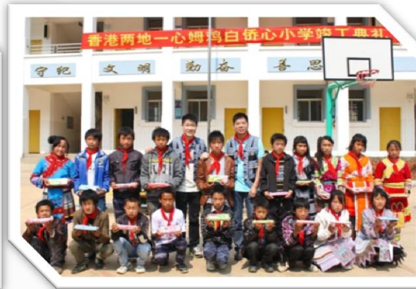
U-Hearts Mu Ji Bai Qiao Xin Primary School Completion Ceremony