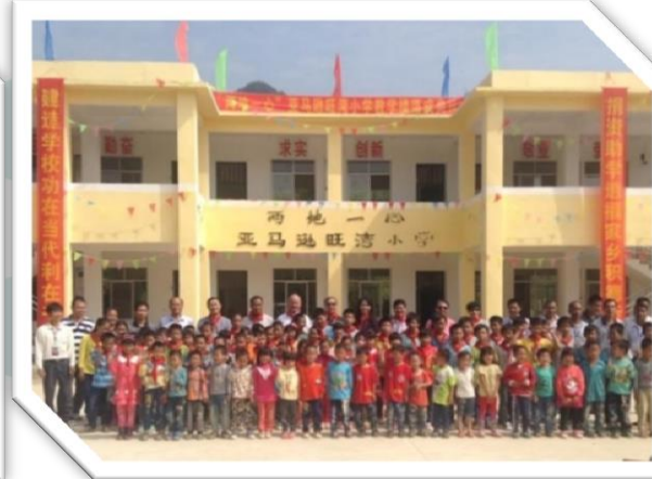
U-Hearts Amazon Chemical Wang Wan Primary School Opening Ceremony